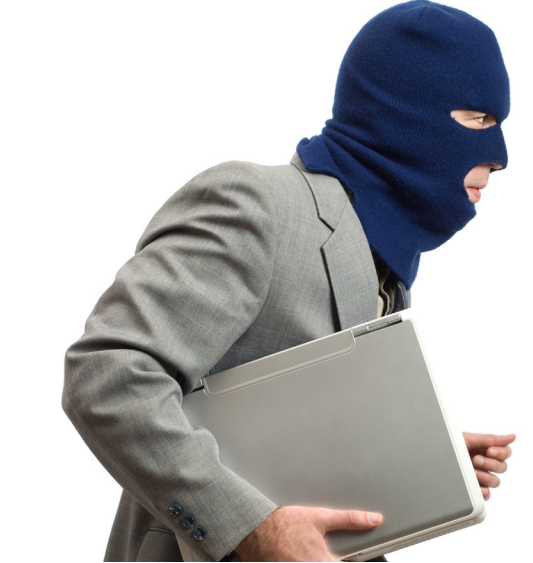
While companies are acutely aware of the dangers of data loss due to hackers, a significant number of IT security breaches are the result of inadequate asset management policies.

need, and it is taking funds from other initiatives that could drive business growth. There can be no doubt: the benefits of comprehensive, real-time asset lifecycle management extend beyond the walls of the data center to influence the financial stability of the company itself – and potentially, that of its customers.